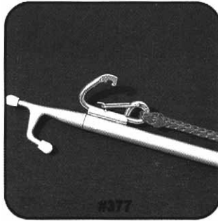
Skiff Hook/Clip (9000# Stainless Steel) Page 3, Item 084