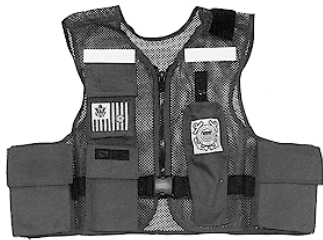
Survival Vest (not PFD) Page 3, Item 103