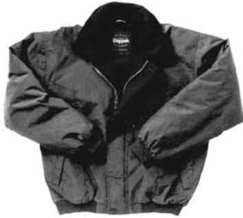
Jacket - Navy Blue Embroidered USCG Auxiliary Logo Page 7, Item 302