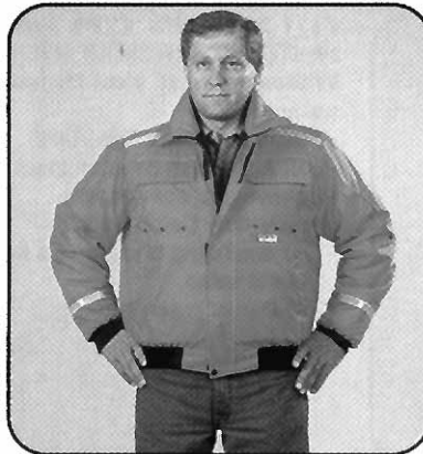
Stearns PFD Bomber Jacket Page 3 Item 089