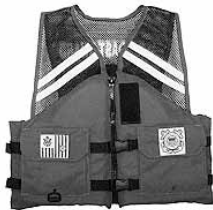
Light-Weight PFD Page 3, Item 102